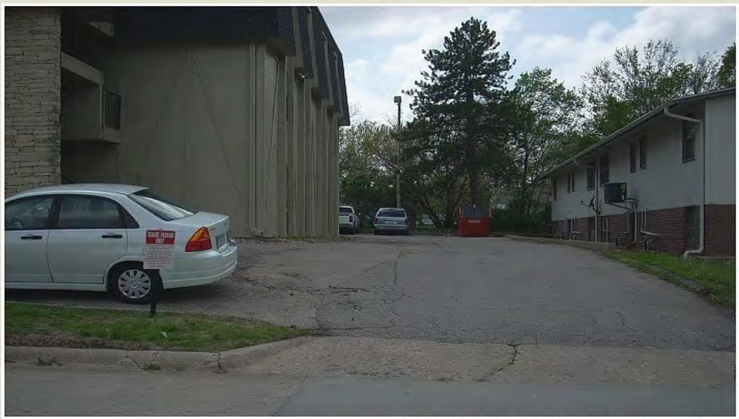
Topeka, KS: Audrey's apartment complex.

Dusk is beginning to fall. Suddenly leaving seems like the stupidest possible idea. A quick peek out another set of windows shows the two figures previously standing over the gory corpse are no longer in